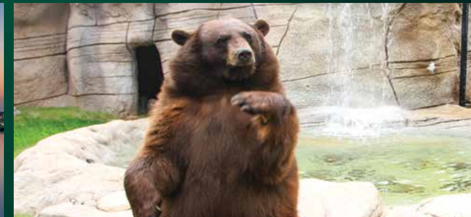
Take a pic at our Bear Habitat and tag @baylorbearhabitat