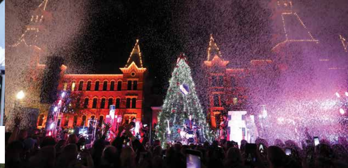
CHRISTMAS ON 5 TH STREET A joyful celebration that includes an annual tree lighting, caroling, a live nativity scene and special musical guests.