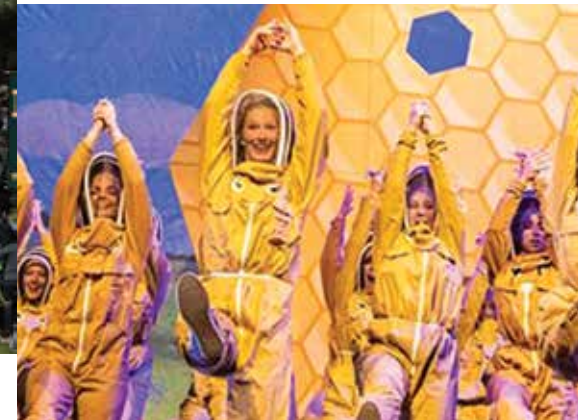
SING Student groups compete for bragging rights in this annual Broadway-style music and dance show.