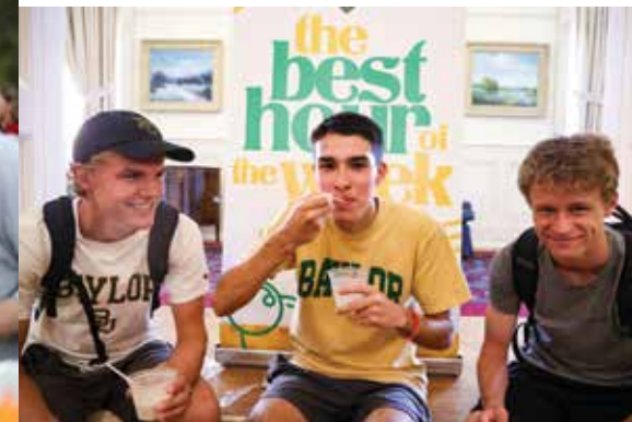
DR PEPPER HOUR Each week since 1953, campus has come together to socialize and enjoy Dr Pepper floats during Dr Pepper Hour.