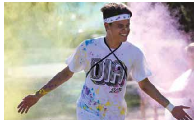
DIADELOSO Since 1934, students have been given a day off in Spring to enjoy the outdoors. Diadeloso, or "Day of the Bear," features athletic tournaments, activities, live music and more.