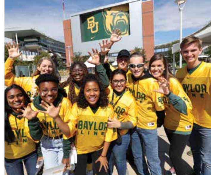
THE BAYLOR LINE This spirit organization, made up of new students — both freshmen and transfers — wears signature gold jerseys as they run on the field at all home football games.