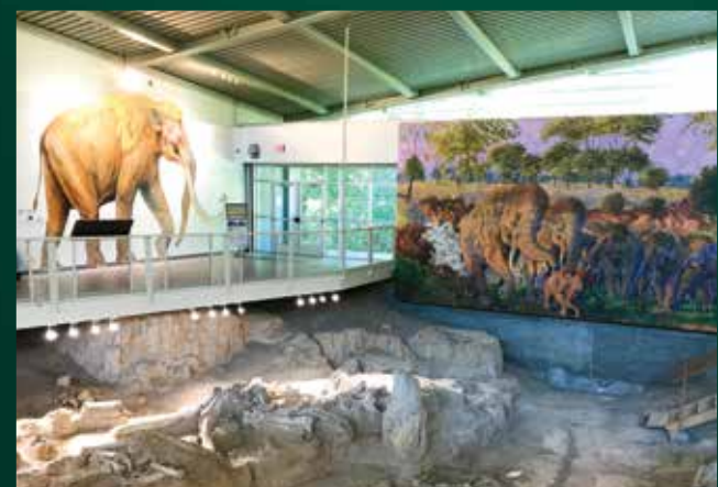
Waco Mammoth National Monument