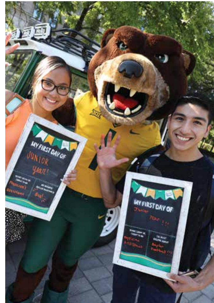
TRANSFER WELCOME WEEK & WEEKEND New Baylor Bears enjoy opportunities to connect with other incoming and returning students before classes start in either the fall or spring.