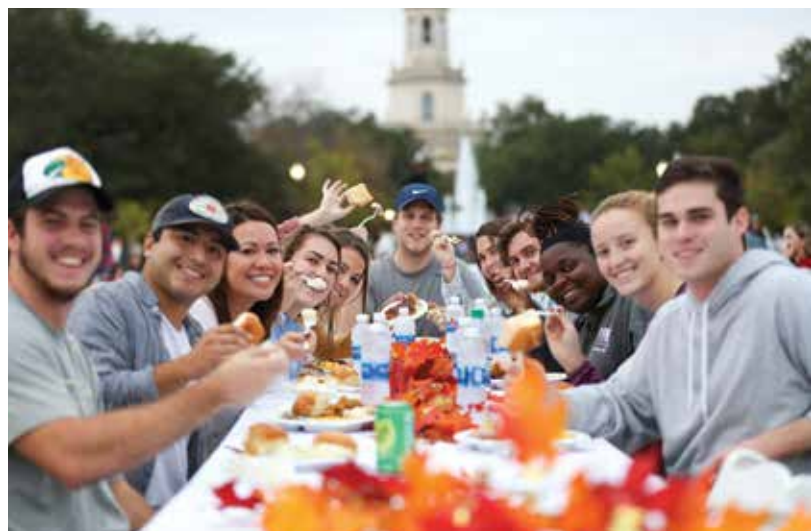
THANKSGIVING DINNER One of the most attended on-campus Baylor traditions, this dinner is a time for students, faculty and staff to come together to enjoy food, games, entertainment and fellowship with the Baylor community.