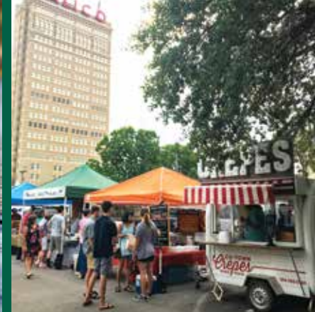
Downtown Farmer's Market