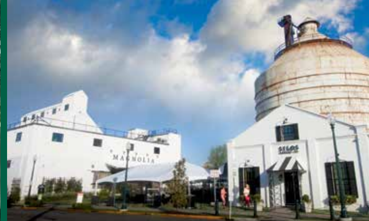
Magnolia Market at the Silos