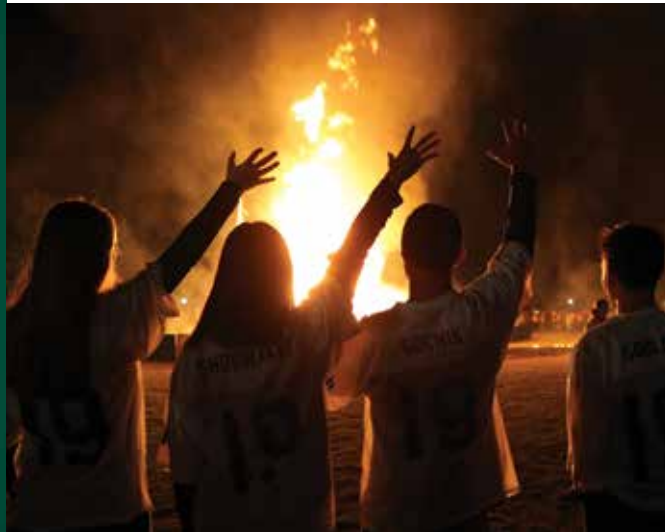
HOMECOMING Baylor is believed to have the nation's oldest and largest Homecoming celebration. Students and alumni enjoy events, such as a bonfire, parade, Pigskin Revue and more.