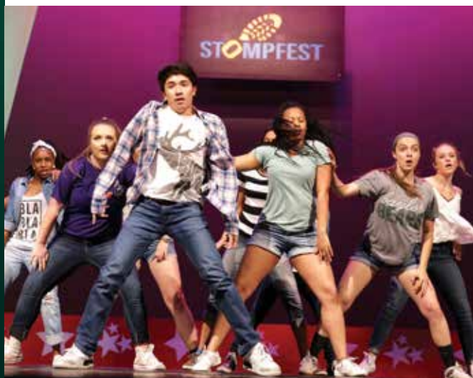
STOMP FEST Teams perform in this annual step show to a variety of musical styles, such as Hip Hop, Rap, Latin American and popular Christian music.