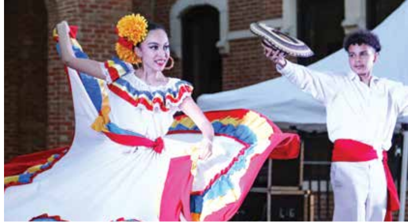
¡FIESTA! A cultural celebration of the diverse cultures of Latin America through cuisine, art, music and performances.

- THE WALL STREET JOURNAL/TIMES HIGHER EDUCATION COLLEGE RANKINGS