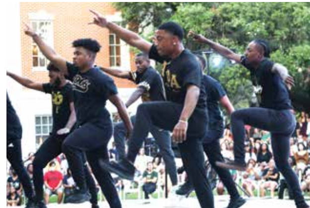
MOSAIC WEEK The wonderful diversity at Baylor is highlighted during a series of events hosted by the Department of Multicultural Affairs.