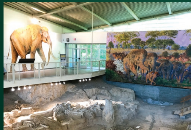
Waco Mammoth National Monument