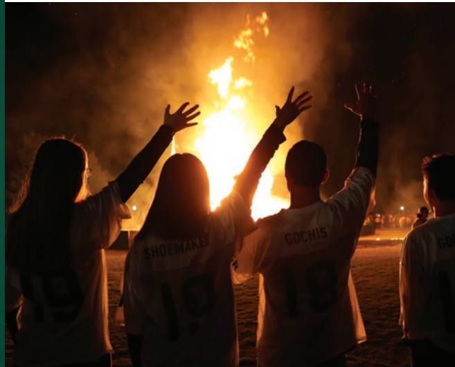
HOME COMING Baylor is believed to have the nation's oldest and largest Homecoming celebration. Students and alumni enjoy events, such as a bonfire, parade, Pigskin Revue and more.