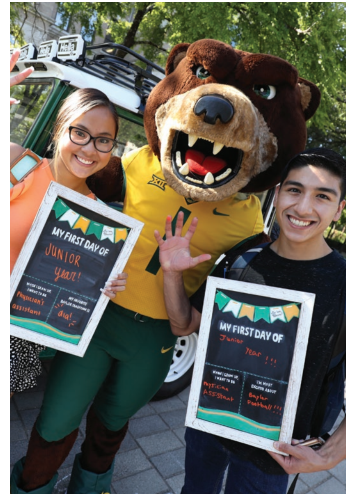
WELCOME WEEK New Baylor Bears enjoy opportunities to connect with other incoming and returning students.