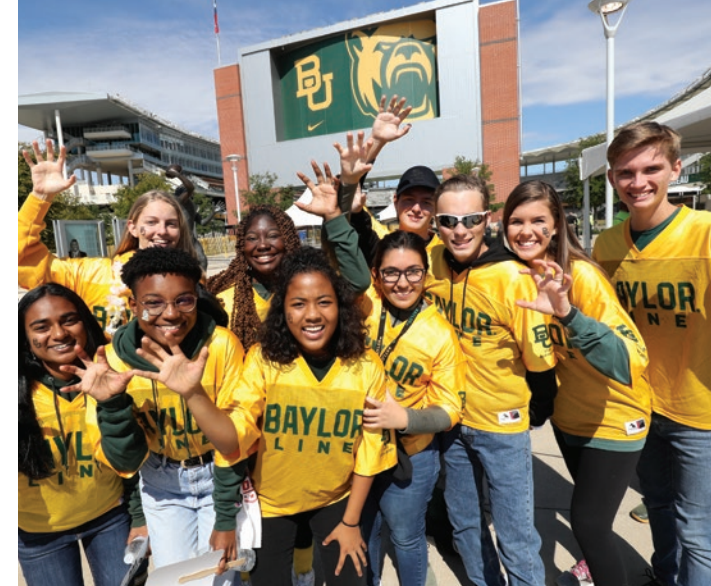
THE BAYLOR LINE This spirit organization, made up of new students, wears signature gold jerseys as they run on the field at all home football games.