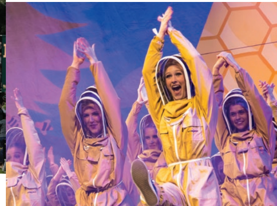
SING Student groups compete for bragging rights in this annual Broadway-style music and dance show.