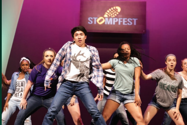
STOMP FEST Teams perform in this annual step show to a variety of musical styles, such as Hip Hop, Rap, Latin American and popular Christian music.