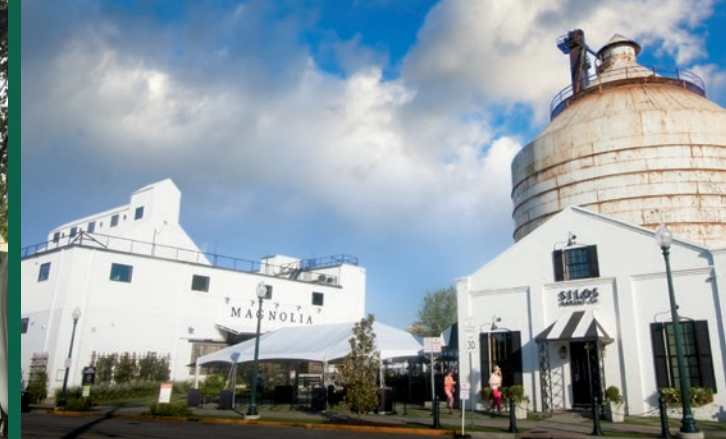
Magnolia Market at the Silos