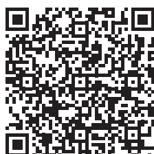
Meet Your Counselor