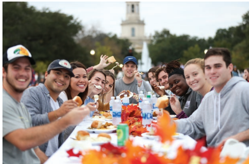
THANKSGIVING DINNER One of the most attended on-campus Baylor traditions, this dinner is a time for students, faculty and staff to come together to enjoy food, games, entertainment and fellowship with the Baylor community.