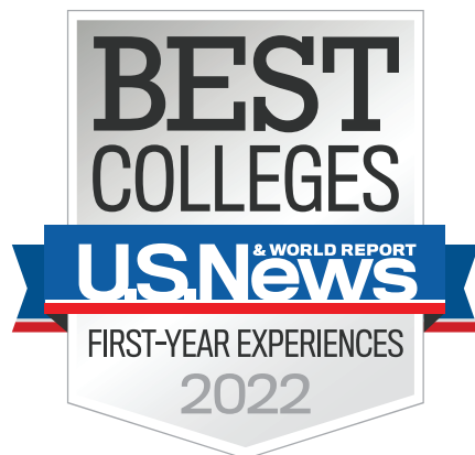
#4 STUDENT ENGAGEMENT - THE WALL STREET JOURNAL/TIMES HIGHER EDUCATION COLLEGE RANKINGS