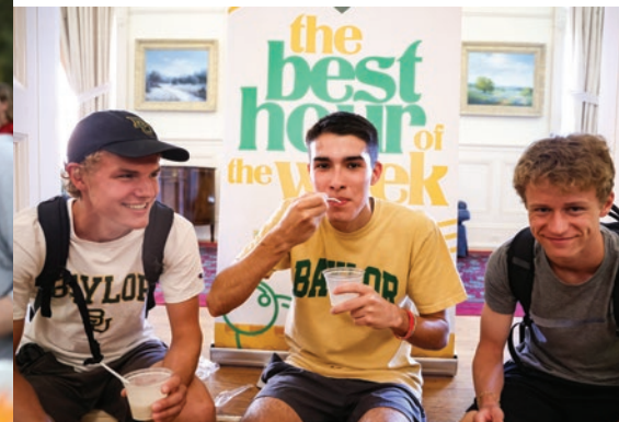
DR PEPPER HOUR Each week since 1953, campus has come together to socialize and enjoy Dr Pepper floats during Dr Pepper Hour.