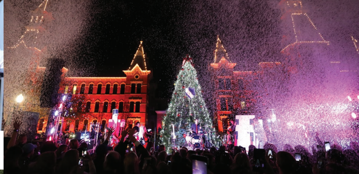
CHRISTMAS ON 5 TH STREET A joyful celebration that includes an annual tree lighting, caroling, a live nativity scene and special musical guests.