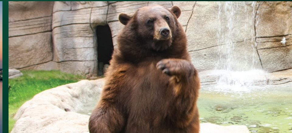
Take a pic at our Bear Habitat and tag @baylorbearhabitat