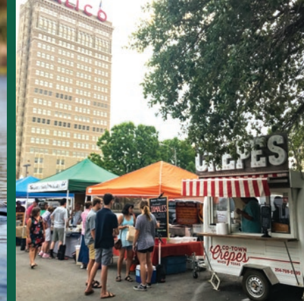
Downtown Farmer's Market