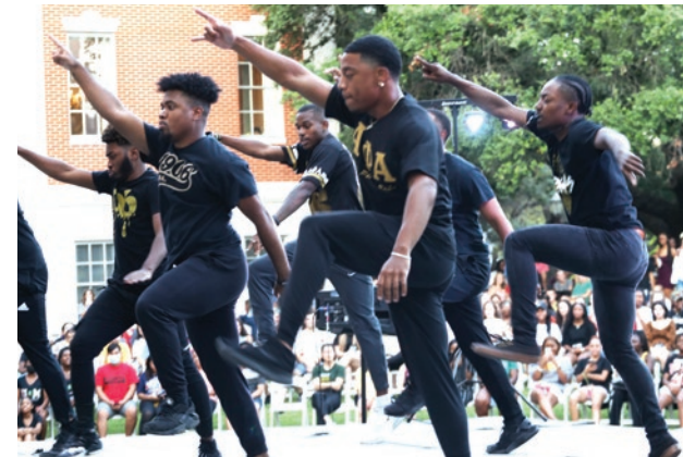
MOSAIC WEEK The wonderful diversity at Baylor is highlighted during a series of events hosted by the Department of Multicultural Affairs.