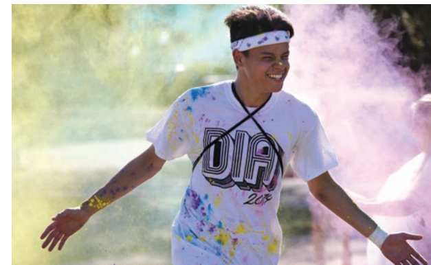
DIADELOSO Since 1934, students have been given a day off in Spring to enjoy the outdoors. Diadeloso, or "Day of the Bear," features athletic tournaments, activities, live music and more.