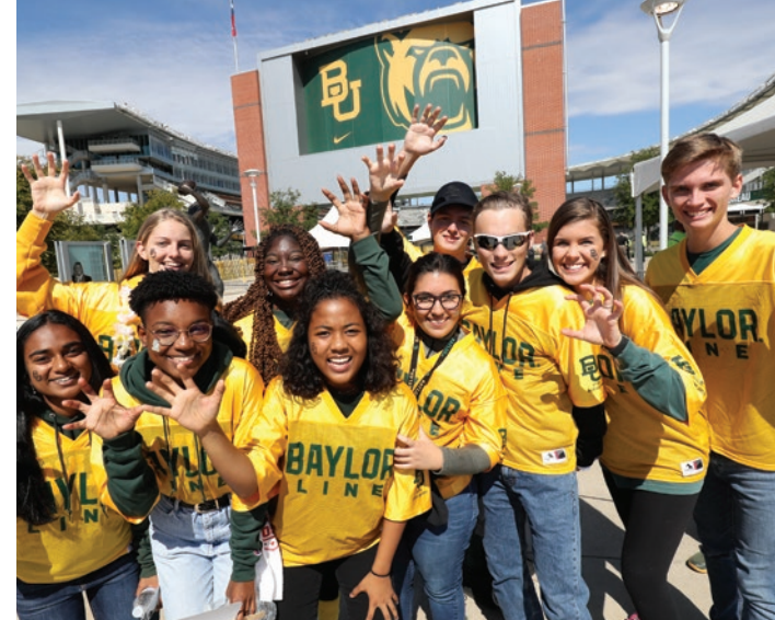
THE BAYLOR LINE This spirit organization, made up of new students, wears signature gold jerseys as they run on the field at all home football games.