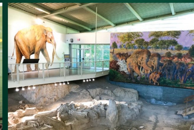
Waco Mammoth National Monument