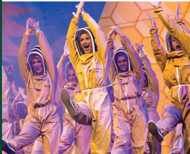
SING Student groups compete for bragging rights in this annual Broadway-style music and dance show.