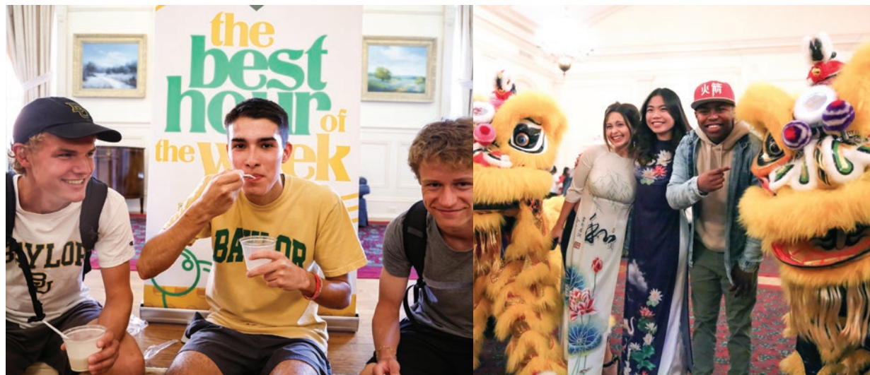
DR PEPPER HOUR Each week since 1953, students, faculty and staff have come together to socialize and enjoy Dr Pepper floats during Dr Pepper Hour.