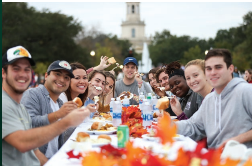
THANKSGIVING DINNER One of the most attended on-campus Baylor traditions, this dinner is a time for students, faculty and staff to come together to enjoy food, games, entertainment and fellowship with the Baylor community.