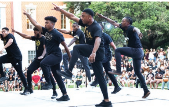
MOSAIC WEEK The diversity at Baylor is highlighted through a series of events, including a student organization fair and cultural showcase, hosted by the Department of Multicultural Affairs.