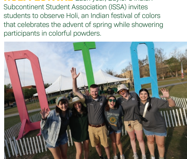
DIADELOSO Since 1932, students have been given a day off in Spring to enjoy the outdoors. Diadeloso, or "Day of the Bear," features athletic tournaments, activities, live music and free food.