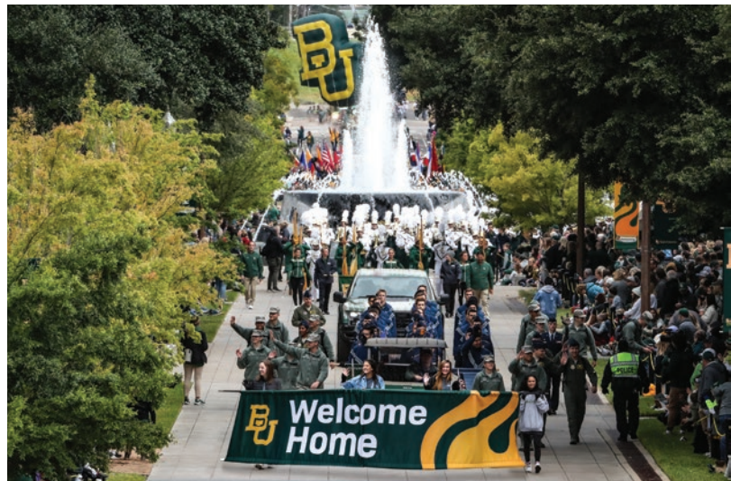
HOMECOMING Baylor is believed to have the nation's oldest and largest Homecoming celebration. Students and alumni enjoy events, such as a bonfire, parade, Pigskin Revue and home football game.