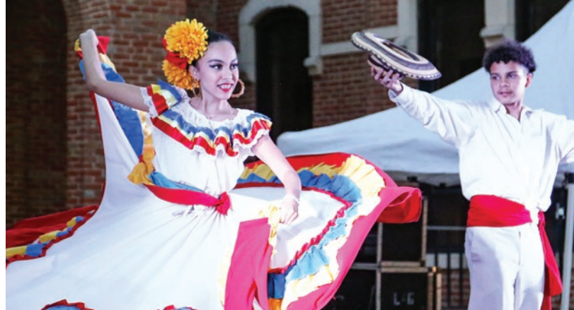
FIESTA! A cultural celebration of the diverse cultures of Latin America through cuisine, art, music and performances.