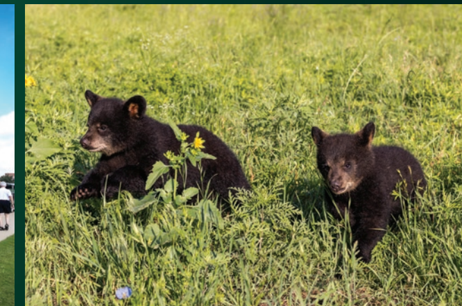
Visit new bear cubs Indy & Belle!