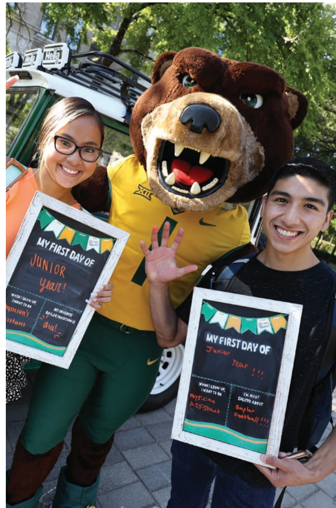
WELCOME WEEK New Baylor Bears enjoy opportunities to connect with other incoming and returning students.