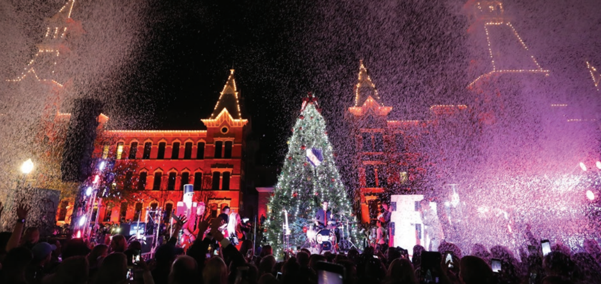
CHRISTMAS ON 5 TH STREET A joyful celebration that includes an annual tree lighting, caroling, a live nativity scene and special musical guests.