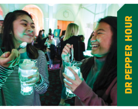
Each week since 1953, faculty, students and staff have come together to socialize and enjoy Dr Pepper floats during Dr Pepper Hour.

Since 1932, students have been given a day off in Spring to enjoy the outdoors. Diadeloso, or "Day of the Bear," features athletic tournaments, activities, live music and more.