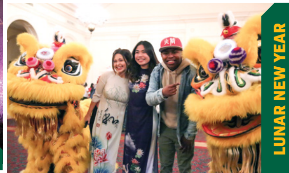
Students ring in the Lunar New Year with live performances, music, free food and the opportunity to learn about many Asian and Chinese traditions.

A joyful celebration that includes an annual tree lighting, caroling, a live nativity scene and special musical guests.