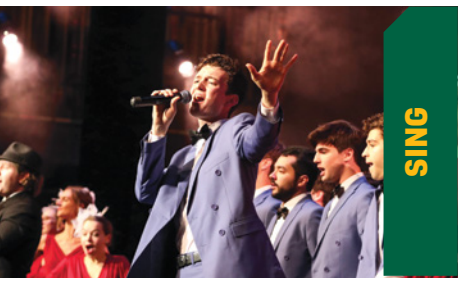
Student groups compete for bragging rights in this annual Broadway-style music and dance show.

Baylor is believed to have the nation's oldest and largest Homecoming celebration. Students and alumni enjoy events, such as a bonfire, parade, Pigskin Revue and more.