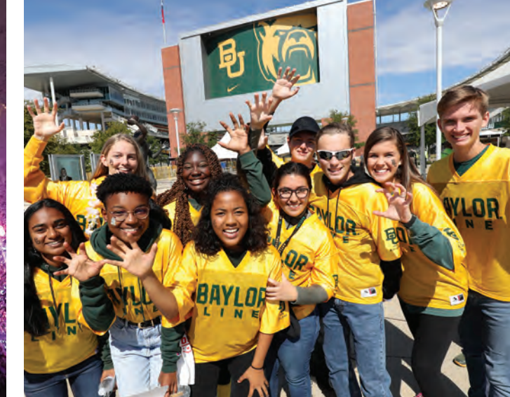
THE BAYLOR LINE This spirit organization, made up of new students, wears signature gold jerseys as they run on the field at all home football games.