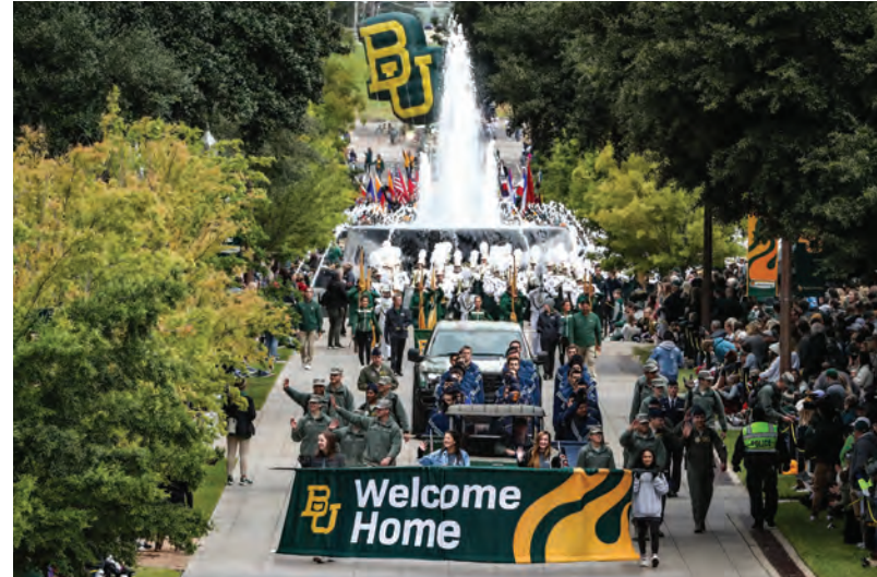
HOMECOMING Baylor is believed to have the nation's oldest and largest Homecoming celebration. Students and alumni enjoy events, such as a bonfire, parade, Pigskin Revue and home football game.