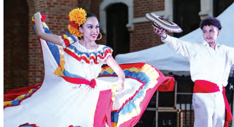
FIESTA! A cultural celebration of the diverse cultures of Latin America through cuisine, art, music and performances.