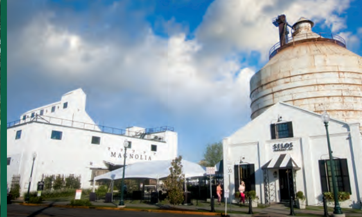
Downtown Farmer's Market