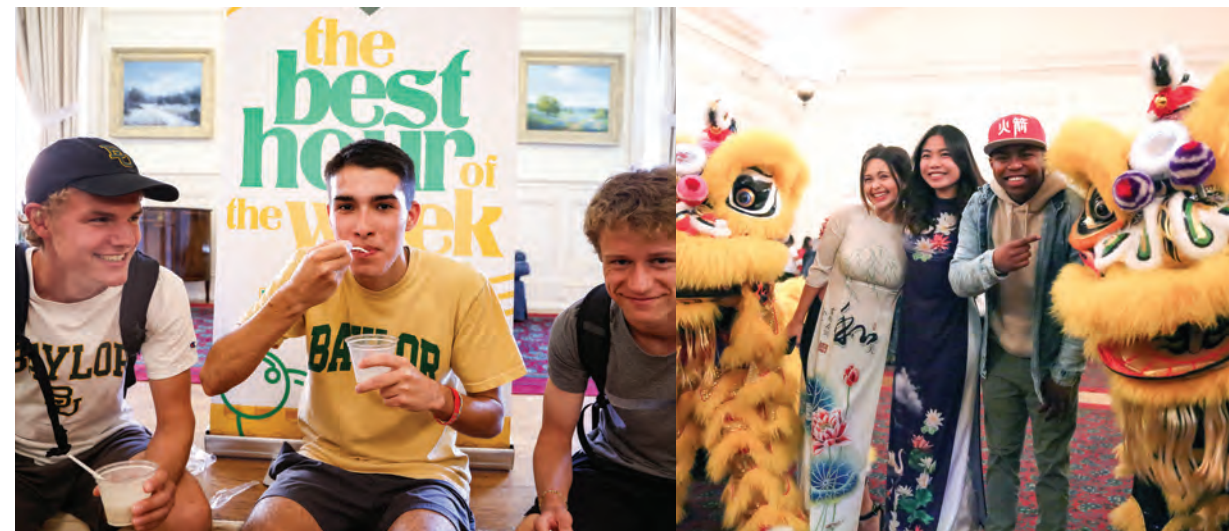
DR PEPPER HOUR Each week since 1953, students, faculty and staff have come together to socialize and enjoy Dr Pepper floats during Dr Pepper Hour.