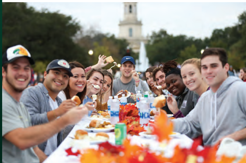
THANKSGIVING DINNER One of the most attended on-campus Baylor traditions, this dinner is a time for students, faculty and staff to come together to enjoy food, games, entertainment and fellowship with the Baylor community.