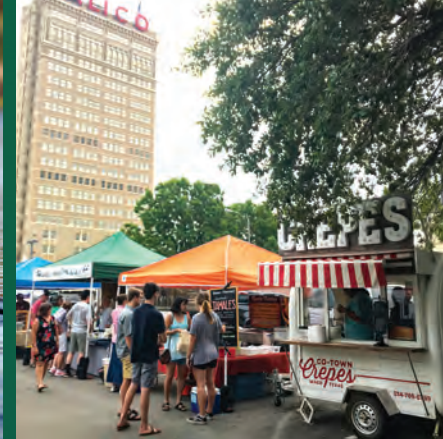
Downtown Farmer's Market