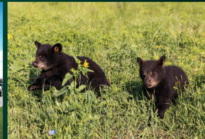
Visit new bear cubs Indy & Belle!