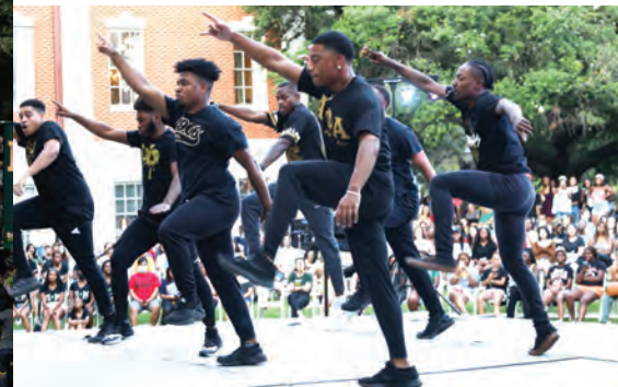
MOSAIC WEEK The diversity at Baylor is highlighted through a series of events, including a student organization fair and cultural showcase, hosted by the Department of Multicultural Affairs.