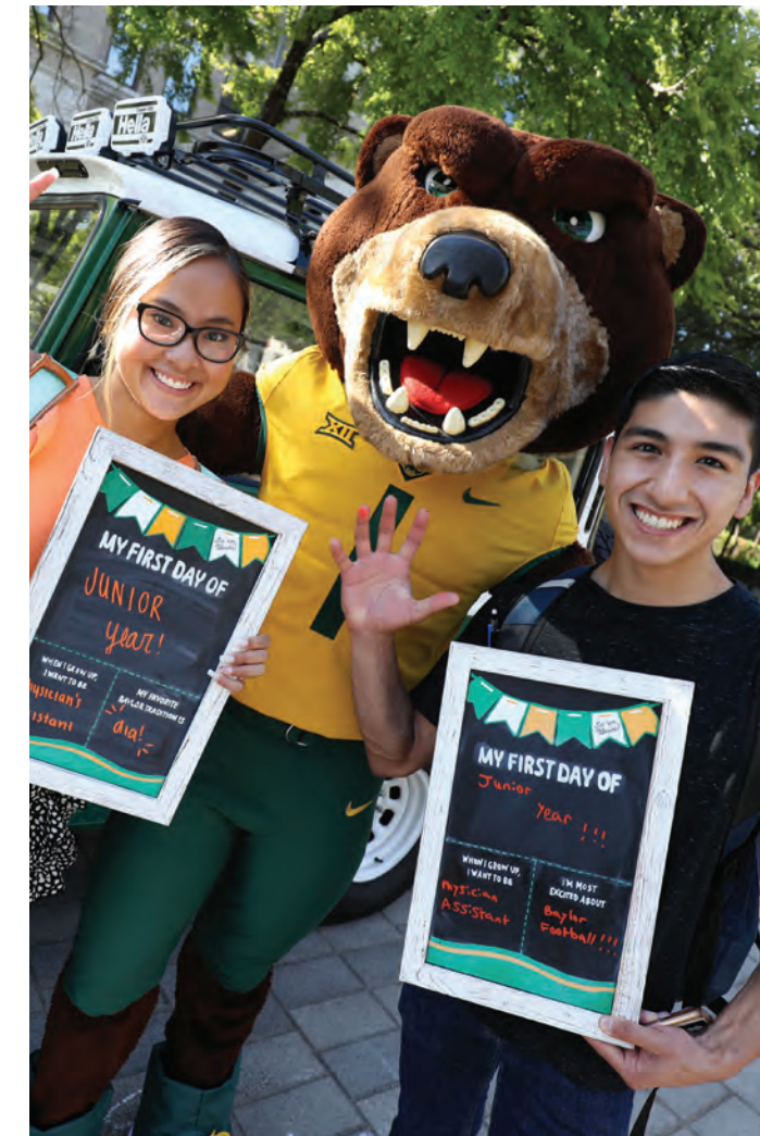
WELCOME WEEK New Baylor Bears enjoy opportunities to connect with other incoming and returning students.