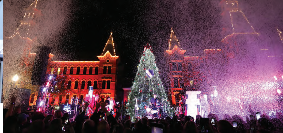
CHRISTMAS ON 5 TH STREET A joyful celebration that includes an annual tree lighting, caroling, a live nativity scene and special musical guests.