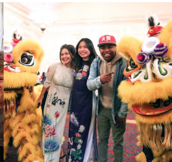
LUNAR NEW YEAR Students ring in the Lunar New Year with live performances, music, free food and the opportunity to learn about many Asian and Chinese traditions.