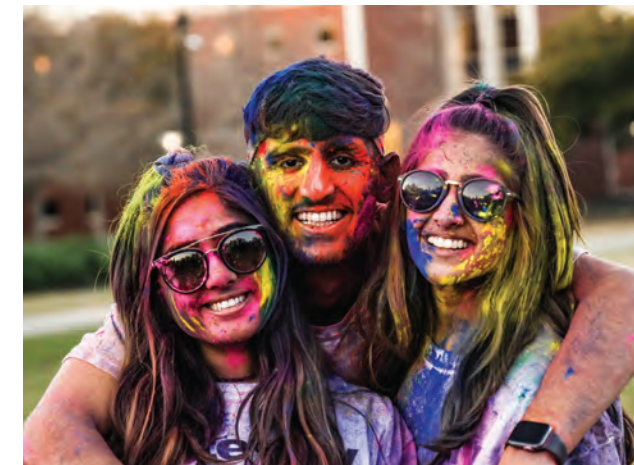
HOLI FESTIVAL Each year, Baylor's Indian Subcontinent Student Association (ISSA) invites students to observe Holi, an Indian festival of colors that celebrates the advent of spring while showering participants in colorful powders.