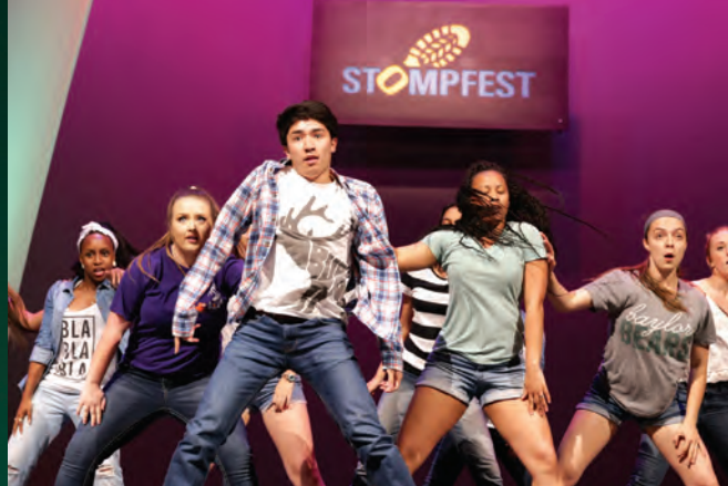
STOMP FEST In this all-university step show, groups perform routines to compete for prize money benefitting their unique philanthropy.