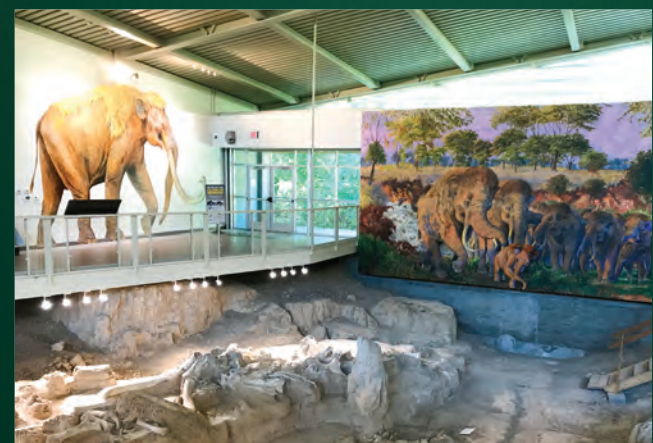
Waco Mammoth National Monument