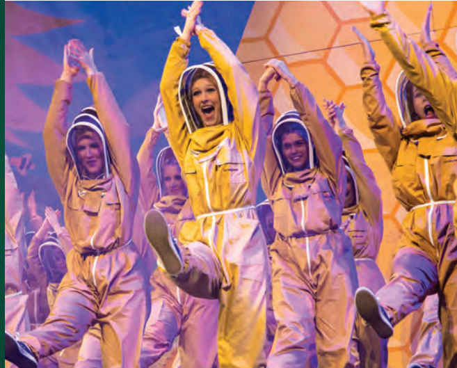
SING Student groups compete for bragging rights in this annual Broadway-style music and dance show.