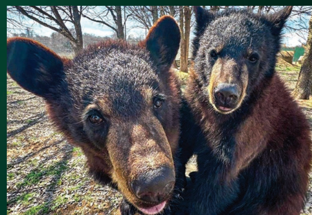
Visit Baylor Bears Indy & Belle!