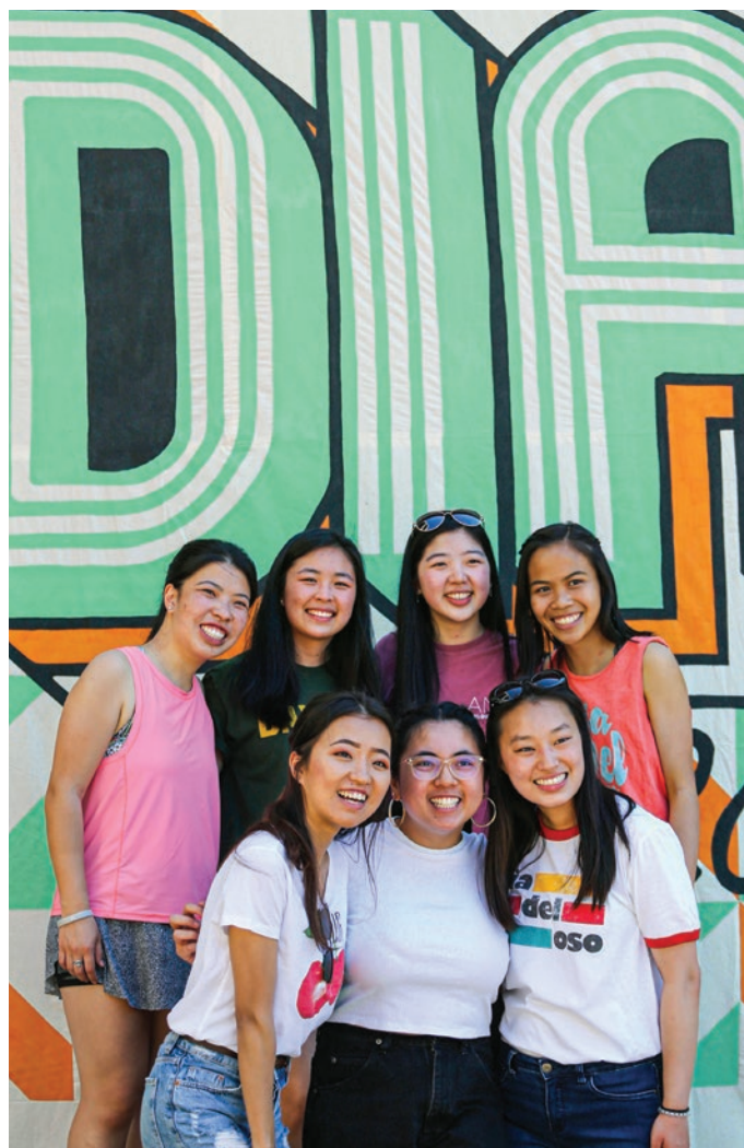
DIADELOSO Since 1932, students have been given a day off in spring to enjoy the outdoors. Diadeloso, or "Day of the Bear," features athletic tournaments, activities, live music and free food.