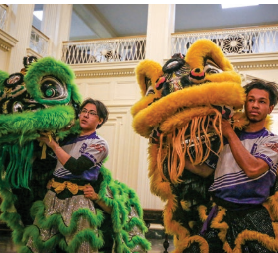
LUNAR NEW YEAR Students ring in the Lunar New Year with live performances, music, free food and the opportunity to learn about many Asian and Chinese traditions.