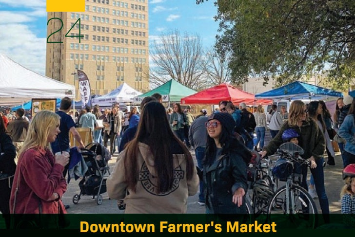
Downtown Farmer's Market