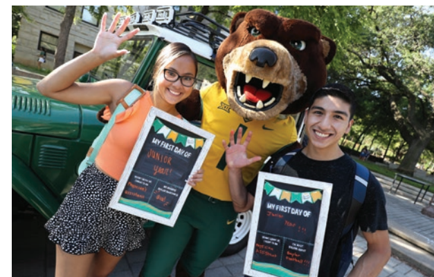
WELCOME WEEK New Baylor Bears enjoy opportunities to connect with other incoming and returning students.