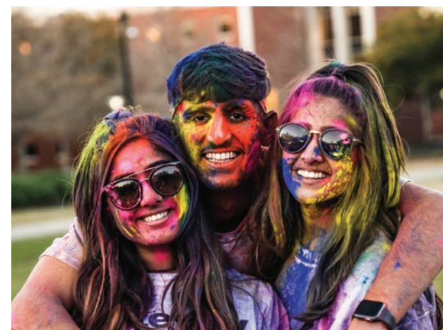
HOLI FESTIVAL Each year, Baylor's Indian Subcontinent Student Association (ISSA) invites students to observe Holi, a festival of colors that celebrates the advent of spring while showering participants in colorful powders.