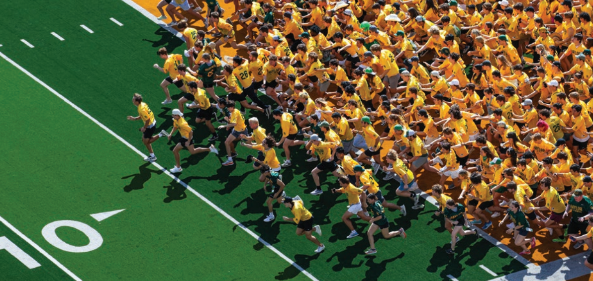
THE BAYLOR LINE This spirit organization, made up of new students, wears signature gold jerseys as they run on the field at all home football games.