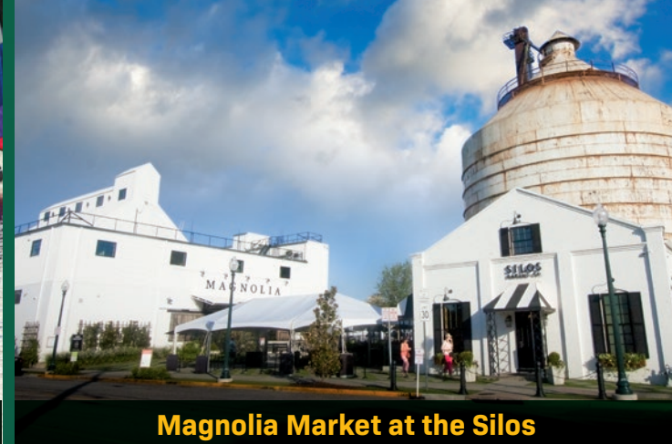
Magnolia Market at the Silos