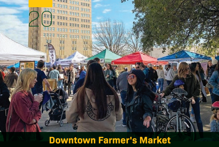
Downtown Farmer's Market